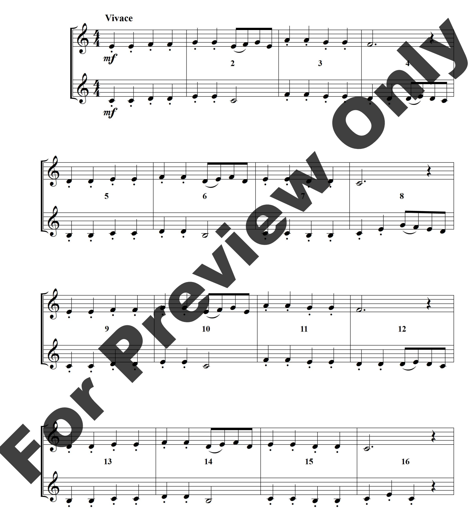
${\rm C}$ 2017 Jim Evans beginning.band - may be reproduced for use at one school as needed